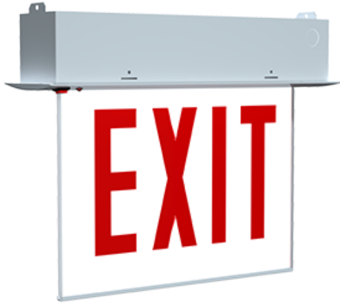
Weight: 6.8 lbs