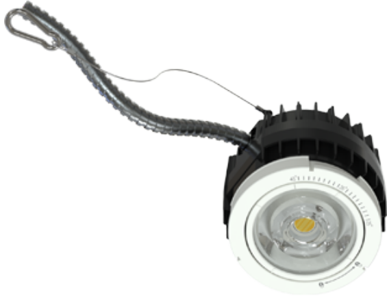
Weight: 2.3 lbs