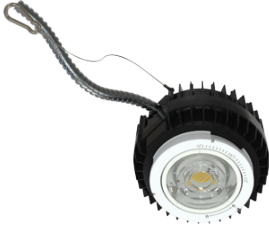
Weight: 3.1 lbs