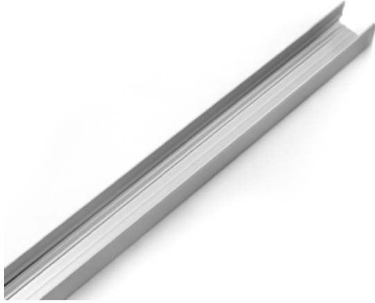
Weight: 3.5 lbs