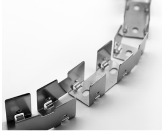
Weight: 2.6 lbs