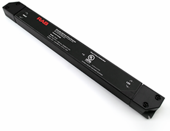
Weight: 0.6 lbs