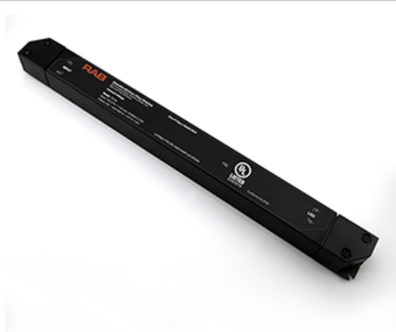
Weight: 0.7 lbs