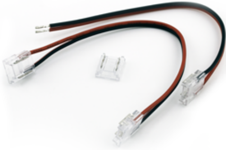
Weight: 0.0 lbs