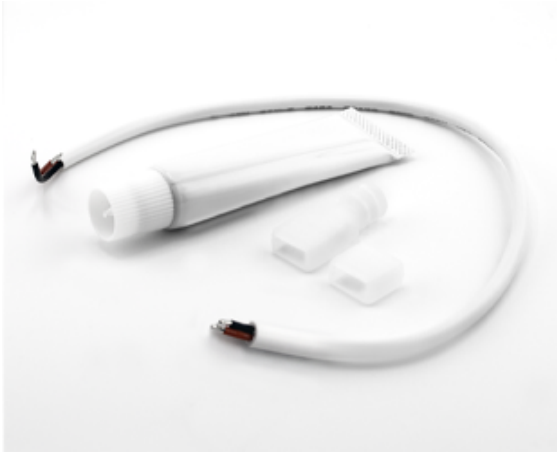
Weight: 0.0 lbs