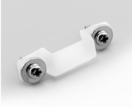
Weight: 0.0 lbs